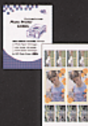
4/2/4 Stickers Kit 4" X 6" 100 prints