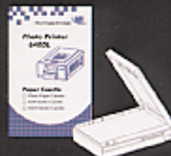
Paper Cassette: a. Photo papers b. 1X1 Stickers c. 4x4 Stickers d. 4/2/4 Stickers