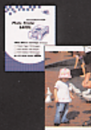
1X1 Stickers Kit 4" X 6" 100 prints