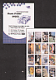
4x4 Stickers Kit 4" X 6" 100 prints